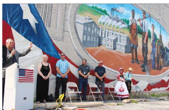
CONTINENTAL CEMENT HERITAGE CELEBRATION