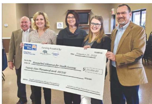
CCC AND GAR DONATE TO THE UNITED WAY OF MARK TWAIN AREA